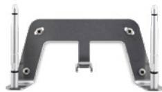
Wall Mountable Kit S30853-H4030-R101